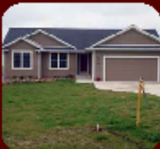
Billy & Deanna Farbus 803 N 5th Ave.