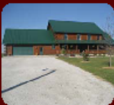
Kirk & Liz Peterson 53733 Highway 210